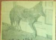
THE WIFE OF... (The text is partially obscured and difficult to read.)