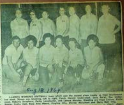
Valley Spring 1967... ...a group of young women... ...a group of young women...