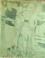
PROOF THEY WILL CATCH BIG ONES in the Lower in this situation will be kept by the U. S. Navy's best work.

Western girls of Mt. St. Helens, Oregon, were taken to the Valley. The girls were taken to the Valley by the U. S. Navy's best work, and their parents are also members of the U. S. Navy's best work.