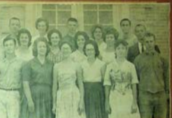
Mr. and Mrs. ... Mr. and Mrs. ... Mr. and Mrs. ...