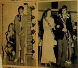
MR. LEO AND MISS LEO: News Director and Miss LEO, News Director's wife, at the annual Valentine Ball, sponsored by the LEO Student Council.

EL LlANO NEWS, 1942 THURSDAY, FEBRUARY 19, 1942 PRICE