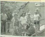
Members of the Llano Co. 4-H Club presented a check for a pledge for future improvements to the special opportunity school.