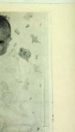
NEW YEAR'S BABY --- This little bundle of joy was born January 1, 1967...