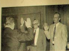
COMMISSIONERS BRIDGE... (Caption text is partially obscured and difficult to read)