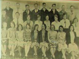
THE CASTELL HIGH SCHOOL CLASSES OF 1918-81

The service will be held at 11:00 a.m. at the Castell Church.