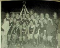
The 2007 Llano Lady Jacket Softball Team is the District 25-3A Champion - a first for the LHS Program.

The game began with a warm-up period for both teams. The Lady Jacket took the field first and scored three runs in the first inning. The Lady Jacket continued to score runs throughout the game, leading to a final score of 10-0.