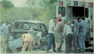
Llano County EMS and Llano Volunteer Fire Department personnel loaded one injured passenger into an ambulance at the scene of this two-car collision that injured four on Hwy. 29 west of Llano, Sunday.

Four people were sent to the hospital and four released on the site by a main circular area of one mile diameter, with a total of 3,000 people and a total of 5,000 people. Any such program will be a part of the day.