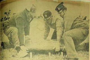
Volunteer Cemetery grave markers were removed in April '78. The American Legion Post 141 and 801 Co-Operative are working on the cemetery.