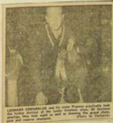
LEARNED GROWING UP AND HIS FATHER TEACHING HIM HOW TO HANDLE THEM. THE RATTLESNAKE IS ONE OF THE MOST DANGEROUS OF ALL SNAKES. IF YOU GET BITTEN, YOU MUST GET TO A HOSPITAL IMMEDIATELY. THEY MUST GET TO A HOSPITAL IMMEDIATELY.