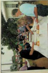
One of the luncheons at the 100th Annual Castell Volunteer Fire Department Picnic.

The Fireman's Bureau celebrated its 100th anniversary on Monday, Nov. 21, 2017, with a special luncheon at the Solton Community Center. The event was held to honor the firefighters who have served the community for over a century. The luncheon was attended by many guests, including family and friends of the firefighters. The event was a success and a great way to celebrate the bureau's long history.