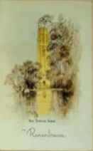
St. Thomas Tower "Remembrance"