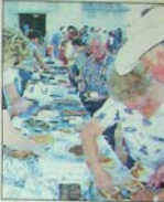
The dinner list was a popular spot of the 22nd Castell VFD Fire Department barbecue event.

which is responsible for providing over 100 square miles of Leno and Lassen County," said Hadden. "With the funds from last year's event, about $400,000 from the Youth Foundation, the fire department has been able to purchase protective clothing and a new pump and engine. This equipment is vital on the fire ground and the status of our fire department are satisfactory to be beyond brush fire to structure and vehicle fires. Our total history of equipment now includes three brush trucks and a fire engine tank." An annual event of this year's gathering, a search-and-rescue exercise was conducted to raise money for maintenance of the old Castell building. Fire department members were extremely helpful in providing information on the building and its history.