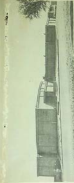
LLANO HIGH SCHOOL

In the abiding belief that Llano County's younger people are the finest in the world, The Llano News and the Business Firm whose signatures appear within dedicate this Souvenir Section to the Llano High School Graduates of 1971 with Heartfelt Congratulations and Best Wishes for Success in their future endeavors.