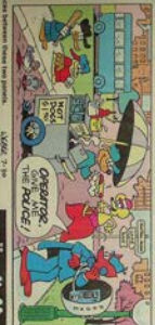
ILLUSTRATION BY JIMMY KNEAS

Can you tell the difference between these two parents?