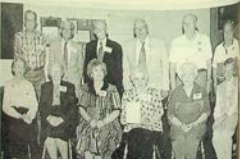
CLASS OF 1936 - The Lane High School class of 1936 held its 60-year reunion at the Church Home on November 20, 1979. The class consisted of 35 members of the class attended a celebration at the Church Home. The class consisted of 35 members of the class attended a celebration at the Church Home. The class consisted of 35 members of the class attended a celebration at the Church Home.