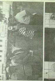
Photo: Local WWII veterans (top row) and guests. (Middle photo) Local WWII veterans (top row) and guests. (Bottom photo) Local WWII veterans (top row) and guests.