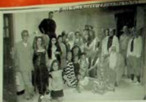
The cast of the Larso Yountree Fire Department's haunted houses was a scary sight.