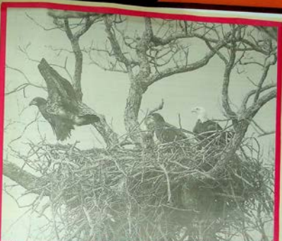
The couples that nested on May 29, 2005 Published by THE LLANO NEWS Jan 19 Feb 1